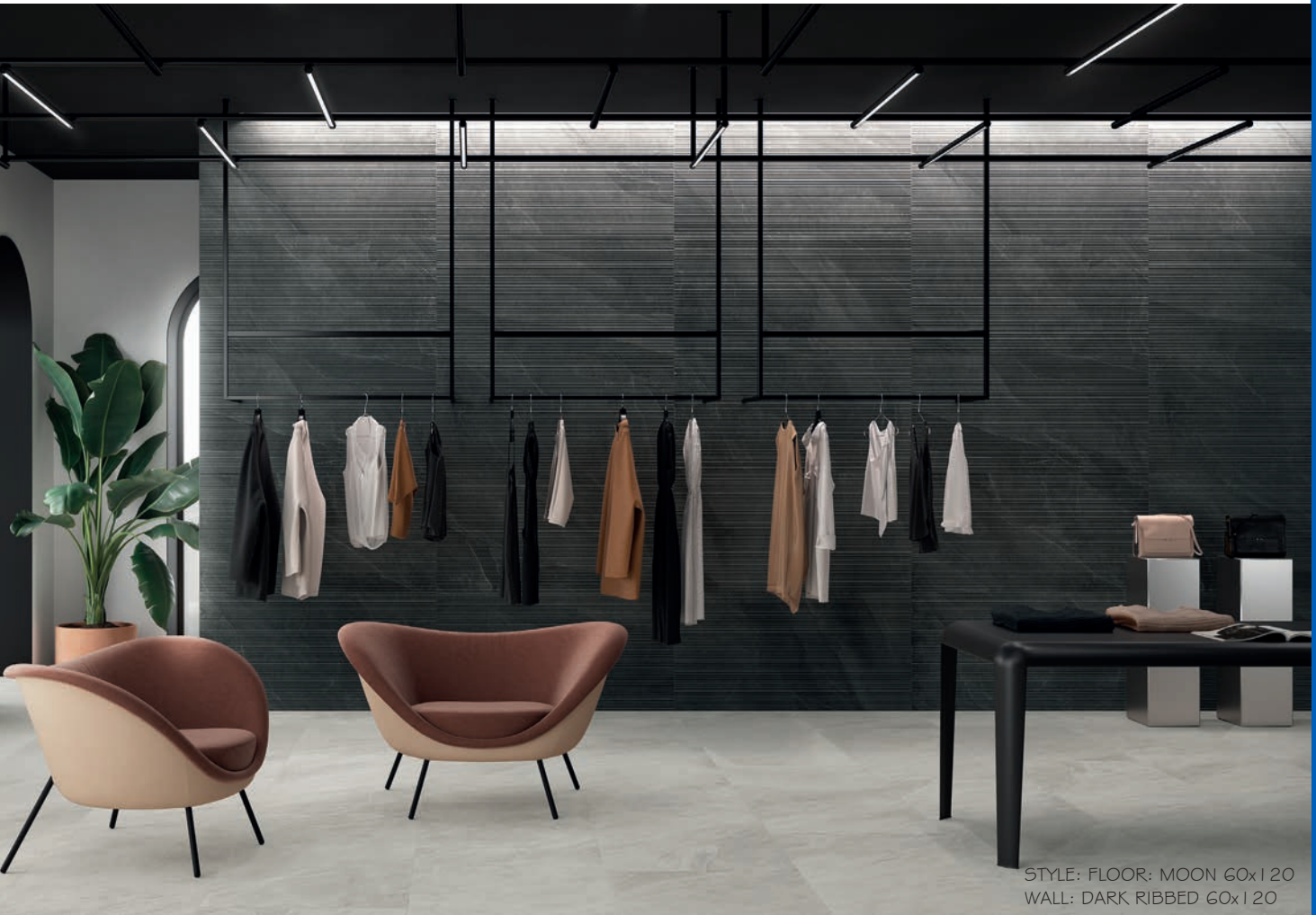
STYLE: FLOOR: MOON 60x120 WALL: DARK RIBBED 60x120