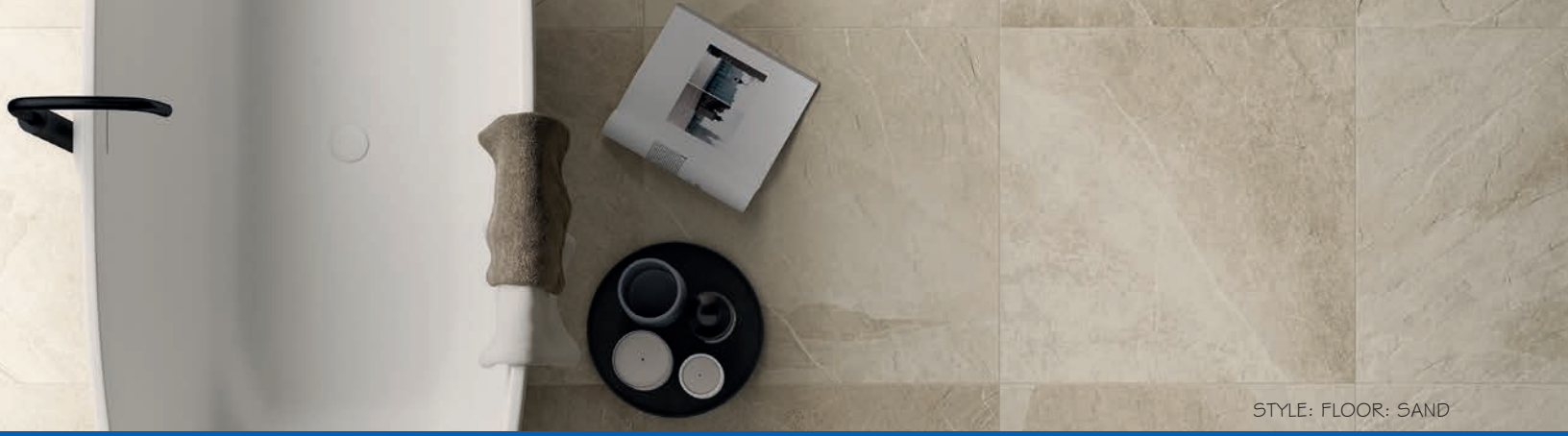
STYLE: FLOOR: SAND