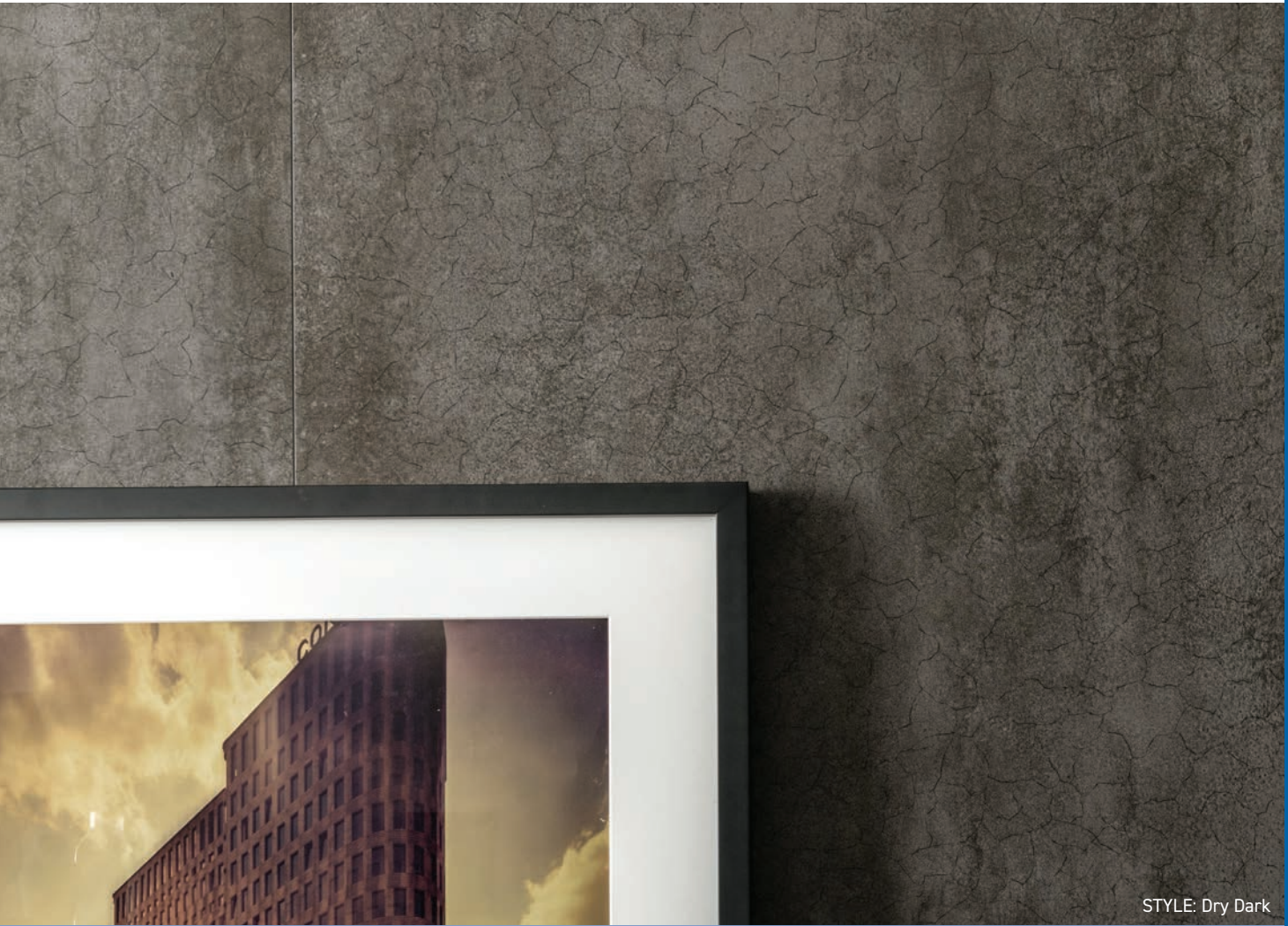
STYLE: Dry Dark