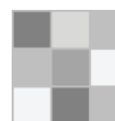
V4 / RANDOM VARIATION